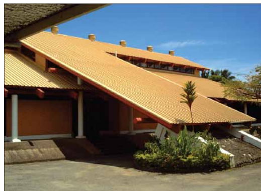
FFA Headquarters, Honiara, Solomon Islands

FFA operates an Observer Program, Vessel Monitoring System, license information list and the FFA Register of Good Standing. FFA also provides technical and operational support to the Western & Central Pacific Fisheries Commission for their Vessel Monitoring System; the WCPFC VMS.